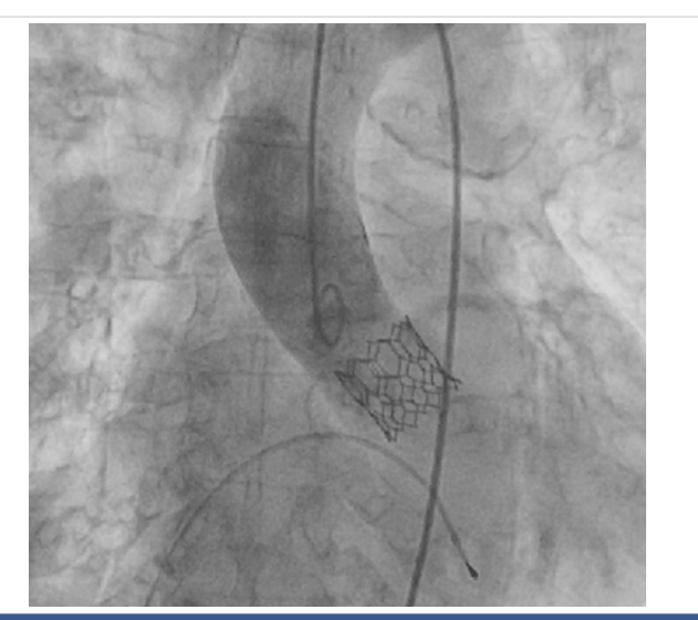
Figure 2: A representative of an aortic CT angiogram of intermediate-size 21.5 mm Myval THV deployed orthotopically without paravalvular leakage.

Discussion on initial TAVI experience with other contemporary devices in Serbia is crucial. A first case series study was carried out at the Catheterization Laboratory of the Clinic for Cardiology, Clinical Center of Serbia. TAVI was performed using SE THVs (CoreValve, Medtronic, MN, USA) on five patients with severe/symptomatic AVS who either had