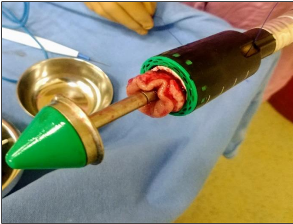
Figure 4: Haemorrhoidal doughnut.

An anal pack was placed, and dressing was done.