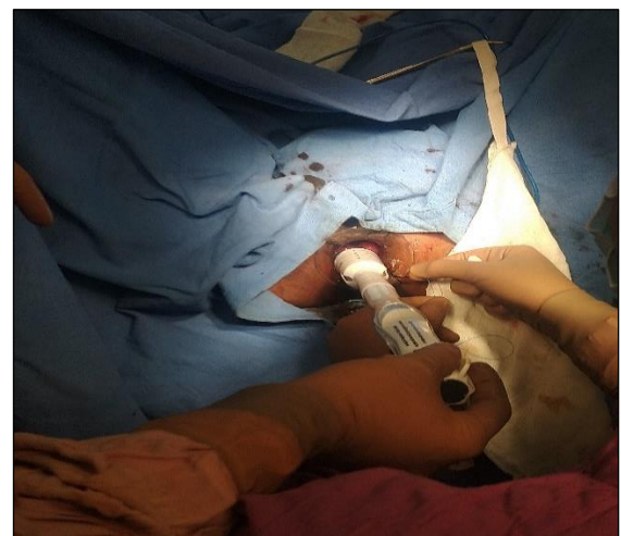
Figure 2: Purse string suture tightened after inserting the anvil.